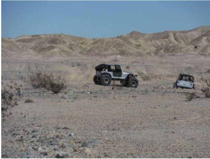
Beautiful day for a run in the desert