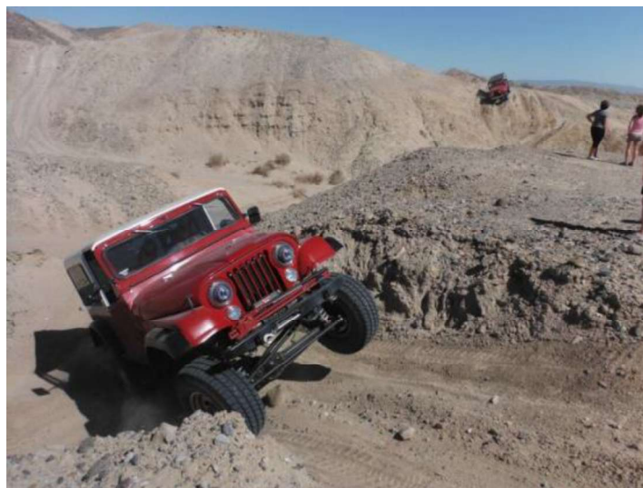
Wheels off the ground!!