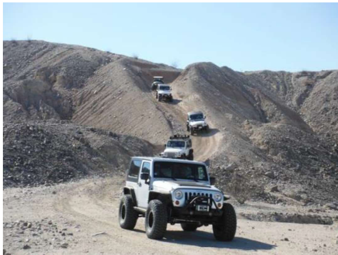
The downhill run!

not mention your name, it is only because I did not get the names before writing this. Thank you! And if you did, please let me or a board member know so we can pay due tribute to you.