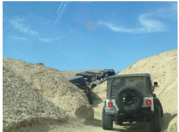
A fun time at the Jim Stout Memorial Gecko Run 2015!