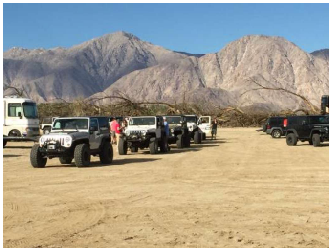
Cavalcaders lining up for the run