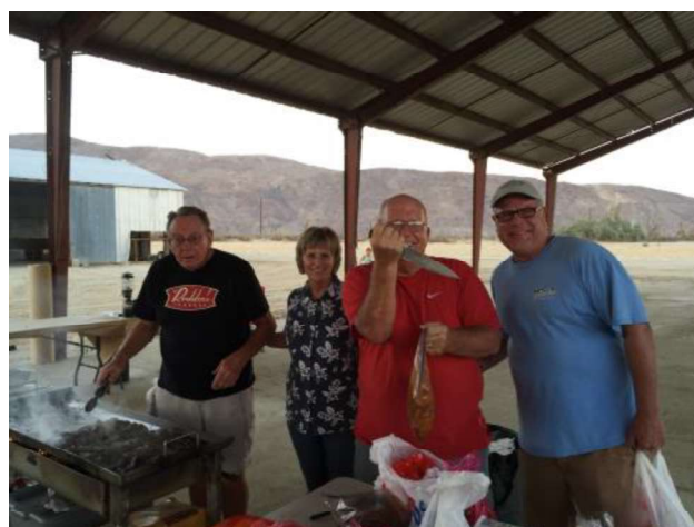
Don't interfere with the masters of the grill as they cook up delicious Carne asada and Pollo asada !