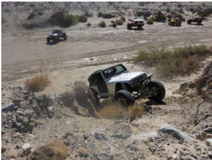
Climbing out of the wash