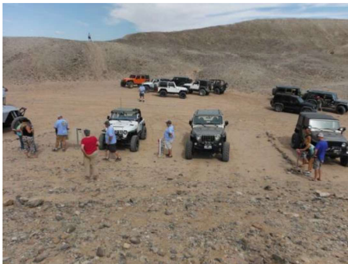
Cavalcaders exploring an RV Park in the Truckhaven area