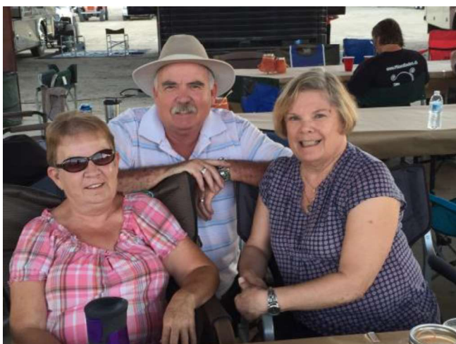
The Portlock Family