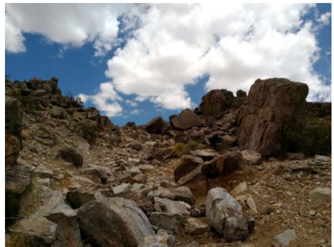
The trails in Johnson Valley await the next Cavalcader adventure seekers.