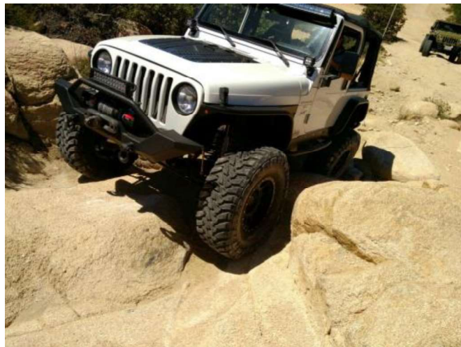
Navigating the challenges on the Silverwood Trail

Now, the next several miles are just easy going with an obstacle or two to try but not very difficult, and you do not have to try them if you don't wish to.