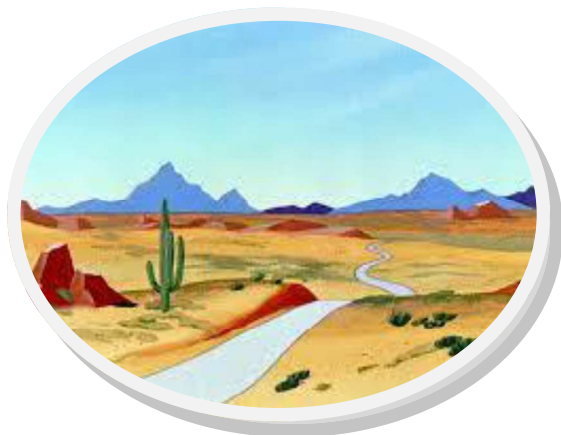
A fun week end of jeeping in the desert is planned

A week end of Jeeping, Dancing, Singing, Eating, and Celebrating the club's Anniversary! Plan to join in all the fun, festivities, and the comradery.