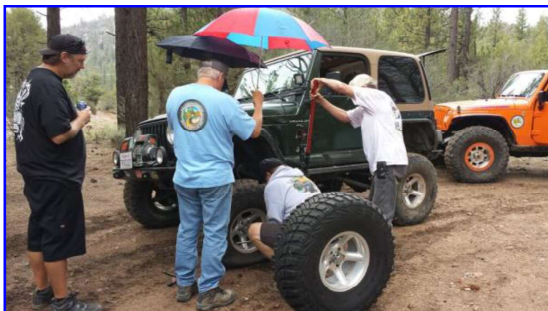
Changing and plugging tires on the Gold Mt/John Bull Run

Respectfully submitted, The Blue Cruiser, or should I say Orange Blossom Express