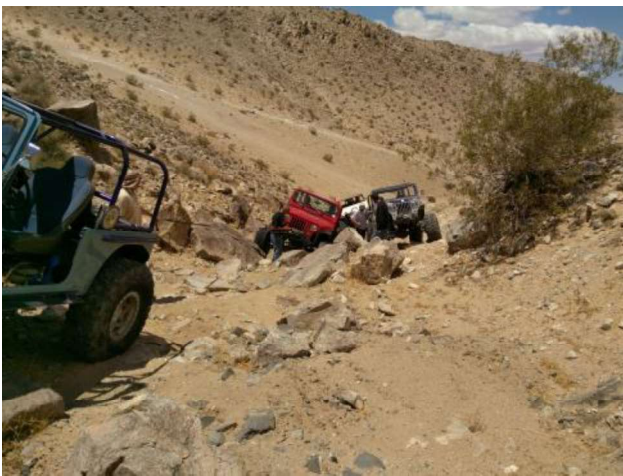
Cavalcaders keep on trekking, guiding, spotting, and navigating on the Johnson Valley Man Run.