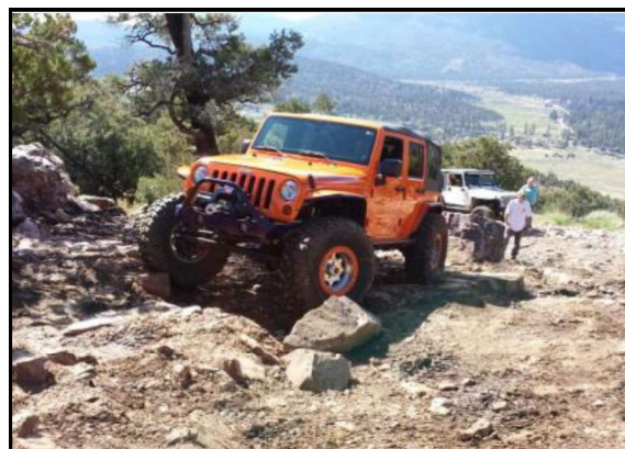
Great spotting on the trail