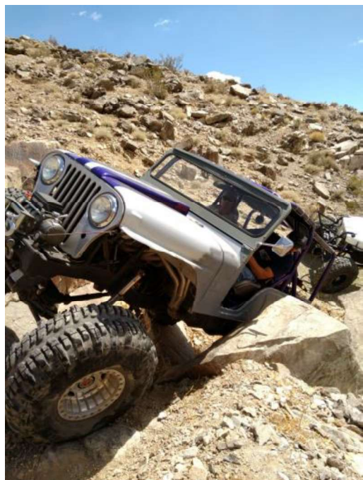
Dennis navigating the obstacles on the trail