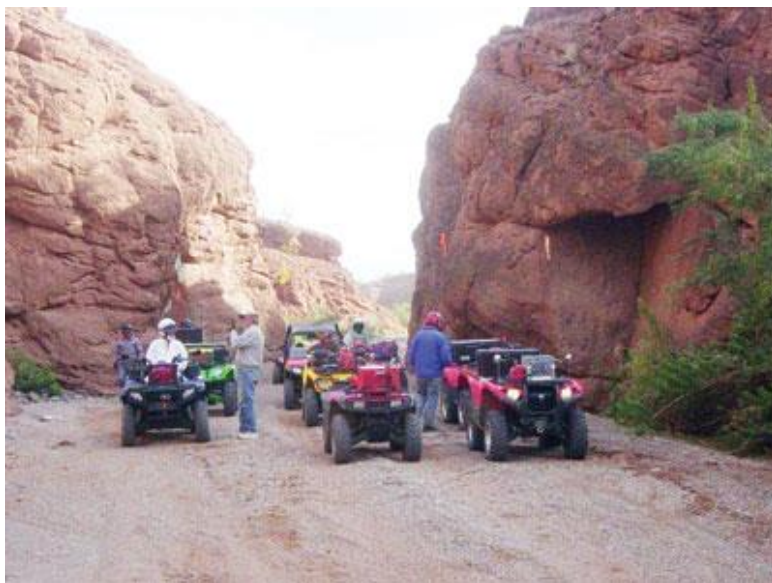
Riding ATVs in the Quartzsite area and on surrounding trails has become a popular hobby that draws people to the area. More trail connections are planned.

Welcome ATVers! We can't wait to see you!