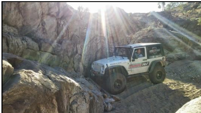
Chiriaco summit trail on-ramp